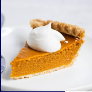
Pumpkin Pie is a tasty Fall treat

Dressing up, Bags of Boo and Activity Night are all part of Halloween celebrations at Acadia!