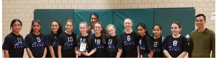
The Grade 7 Girls Diggers team takes 2nd place at the Sargent Park Tournament

second set Acadia won 26-24, but lost in a 3rd set 16-14, but that is the lowest score they could have lost by. In conclusion, the girls had so much fun and we are so proud of them.