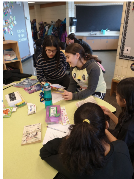
Above: Reading buddies at Dalhousie

have a great and wonderful time with our grade 4 buddies.